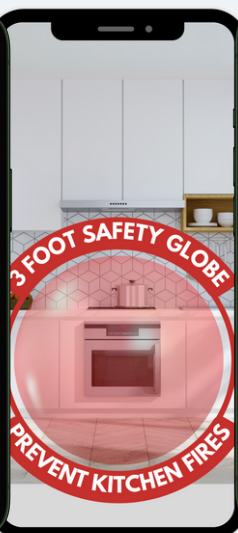
Kitchen Safety Globe