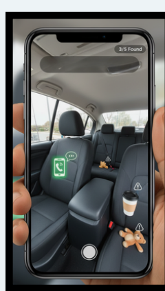
Spot the Distraction