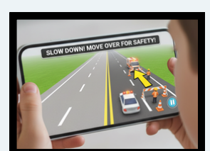
Move Over & Go the Speed Game