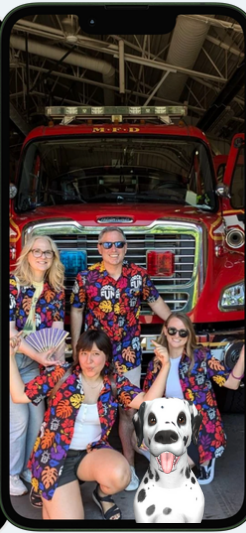
High Five A Dalmatian