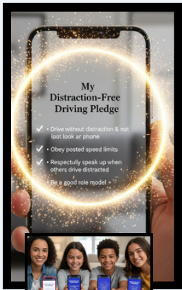
Sign Pledge & Get A Digital Badge

This is a national AR-powered movement teaching kids to be the voice of safety helping end distracted driving one family at a time. This initiative transforms kids into Safety Ambassadors using Augmented Reality, challenges, and social media to inspire families and communities to drive distraction-free. Each experience connects back to a simple truth: If kids can see the danger, adults can change their behavior.