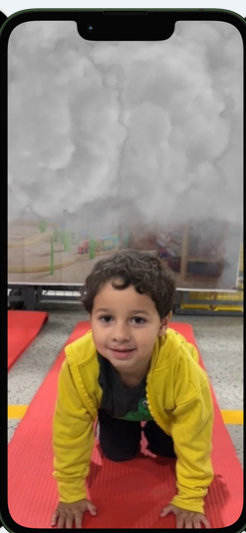
Get Low and Go (Crawl Under Smoke)