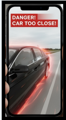
In Their Boots Make Buffer Zone