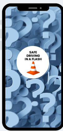
End DD in A Flash